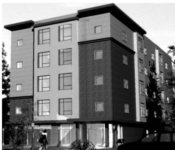
Artist's sketch of SHOW apartments – under construction and due for completion July 2010.

Supportive Housing of Waterloo (SHOW) has just the thing for that person on your shopping list who “has everything”. A donation to SHOW as a gift to a friend or family member can deliver a wonderful threefold benefit this Christmas season. The recipient of the gift will be delighted with the thought that their gift will enhance the quality of life for a homeless individual in our own community. You, as the sender, will also have the satisfaction of knowing that your gift matters and is not just an obligatory gesture. and, of course, the homeless people of Waterloo for whom this supportive facility is now rising at 362 Erb Street West, will be the biggest benefactors of all.