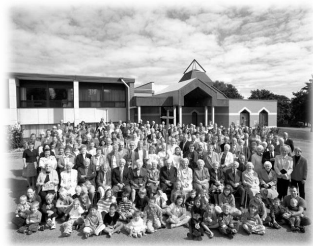
The 50 th Anniversary Congregational Photo

I started with reality: with the last full year’s worship attendance figures – as recorded in Mount Zion’s 2010 Annual Report to the congregation.