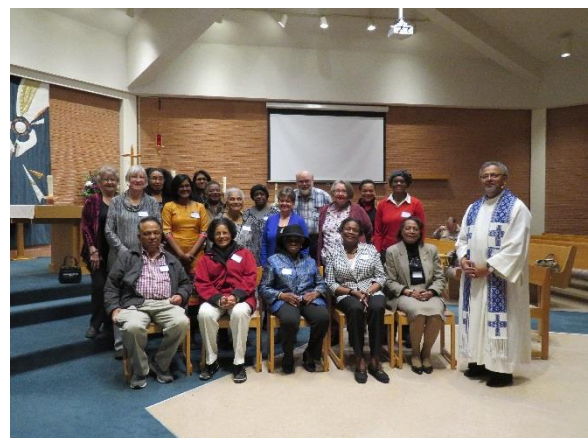
New Member Sunday