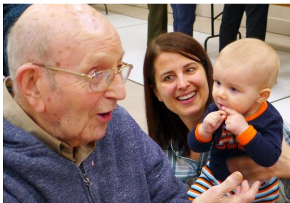
More Pancake Supper Photos