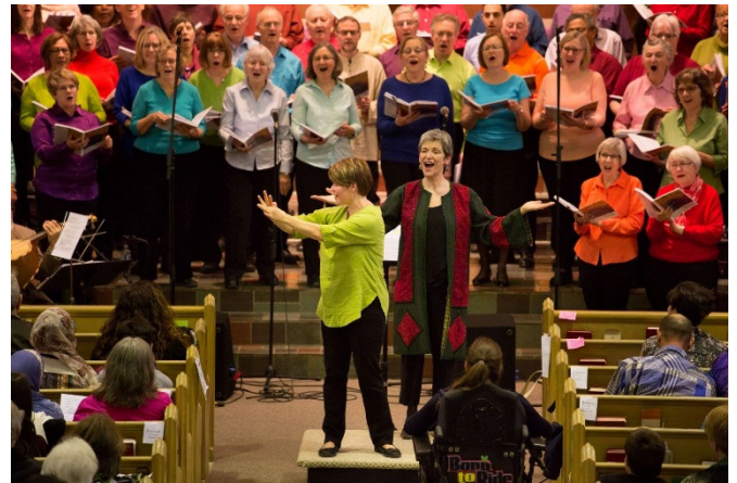
Singing and signing at a recent Inshallah concert

And so they did. With a grant from the Global Hunger