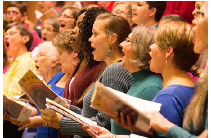
Inshallah meets for signing together on Tuesday nights at 5 p.m. New members are always welcome at the beginning of the term. Because the seminary building is under construction, practice will be held at St Michaels Church, on University Avenue directly across the street from the WLU Campus in September.

It all started with the gift of a song book. Who could have foreseen what an impact that simple gift would make?