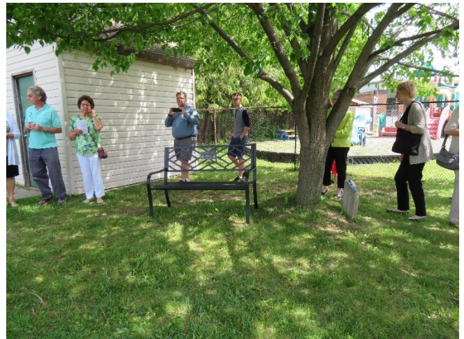
Service of Seeds and Soil 2017.

Blessing of the Seeds and Soil May 26 following the service (Approximately 11:15 am.)